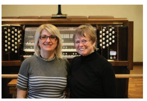
Thank you to each one who shared in the adventure. Each of you contributed to the creation of a lovely ambiance to support the success of the afternoon.

We shared with people of all ages the welcoming spirit of both Woodroffe United Church and RCCO-Ottawa Centre. And, we raised money to support Beginning Organists' Scholarships.